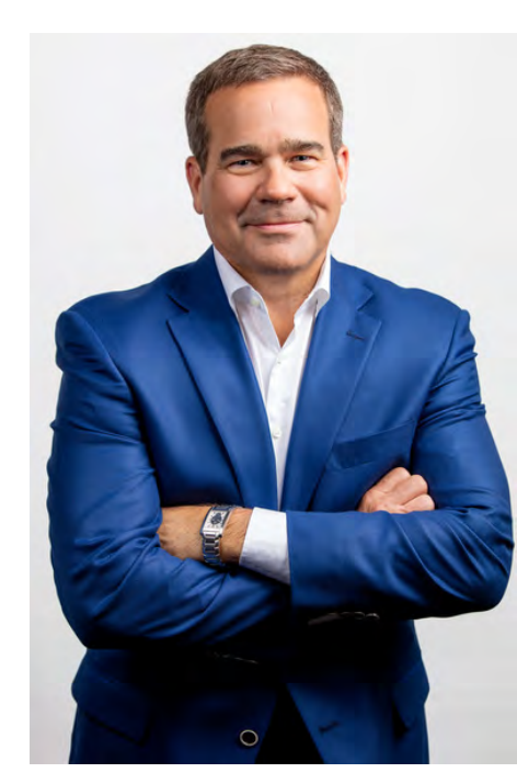
"We know innovation is crucial to our growth, and our collaboration with the Global Insurance Accelerator plays an integral role in that success."

The opportunity to bring such influence and innovation right to our doorstep was also exciting. At the time, there were no other insurance focused accelerators in Des Moines, or elsewhere, and certainly no other accelerators created by a partnership between industry incumbents. This was an opportunity to lead. Thanks to the Global Insurance Accelerator and its many supporters, over the past decade, we've done just that. The program has attracted founders from five continents and invested more than $3 million in early-stage Insurtech companies.